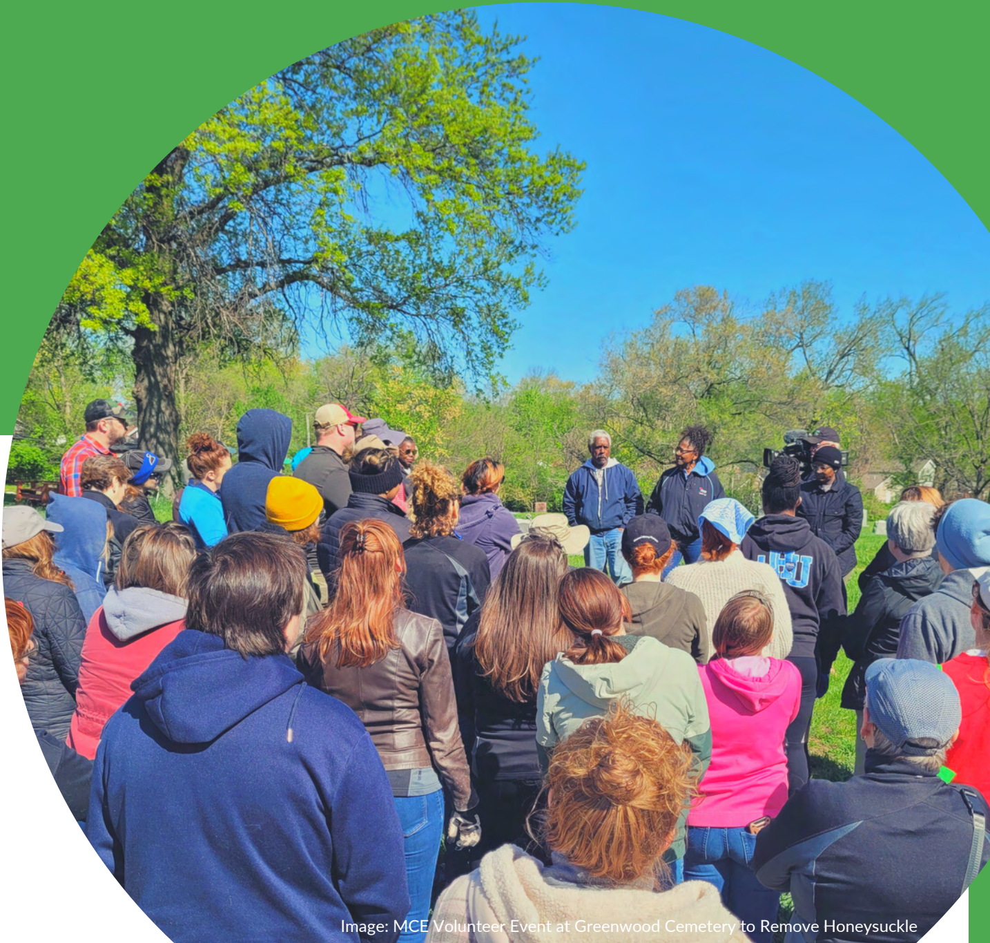
Image: MCE Volunteer Event at Greenwood Cemetery to Remove Honeysuckle