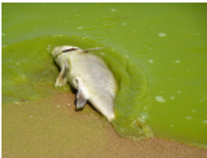
Dead fish in algae.

Write down a summary of what you see and, if possible, have someone else verify it by recording their name or their comments.