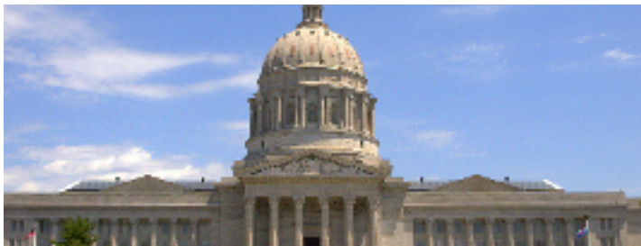
Missouri State Capitol.

There are a list of exclusions in the Sunshine Law, so you may not receive everything you want or some items may be redacted. In some cases, you may want to challenge the reason given for denying a request.