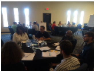
(Left) West Lake Landfill Teach-In. (Right) Environmental Justice Convergence.