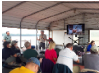
The U.S. Army Corps of Engineers River Resources Action Team Meeting on the Mississippi River.