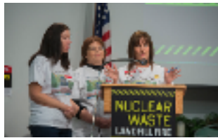
West Lake Landfill teach-in to raise public awareness.